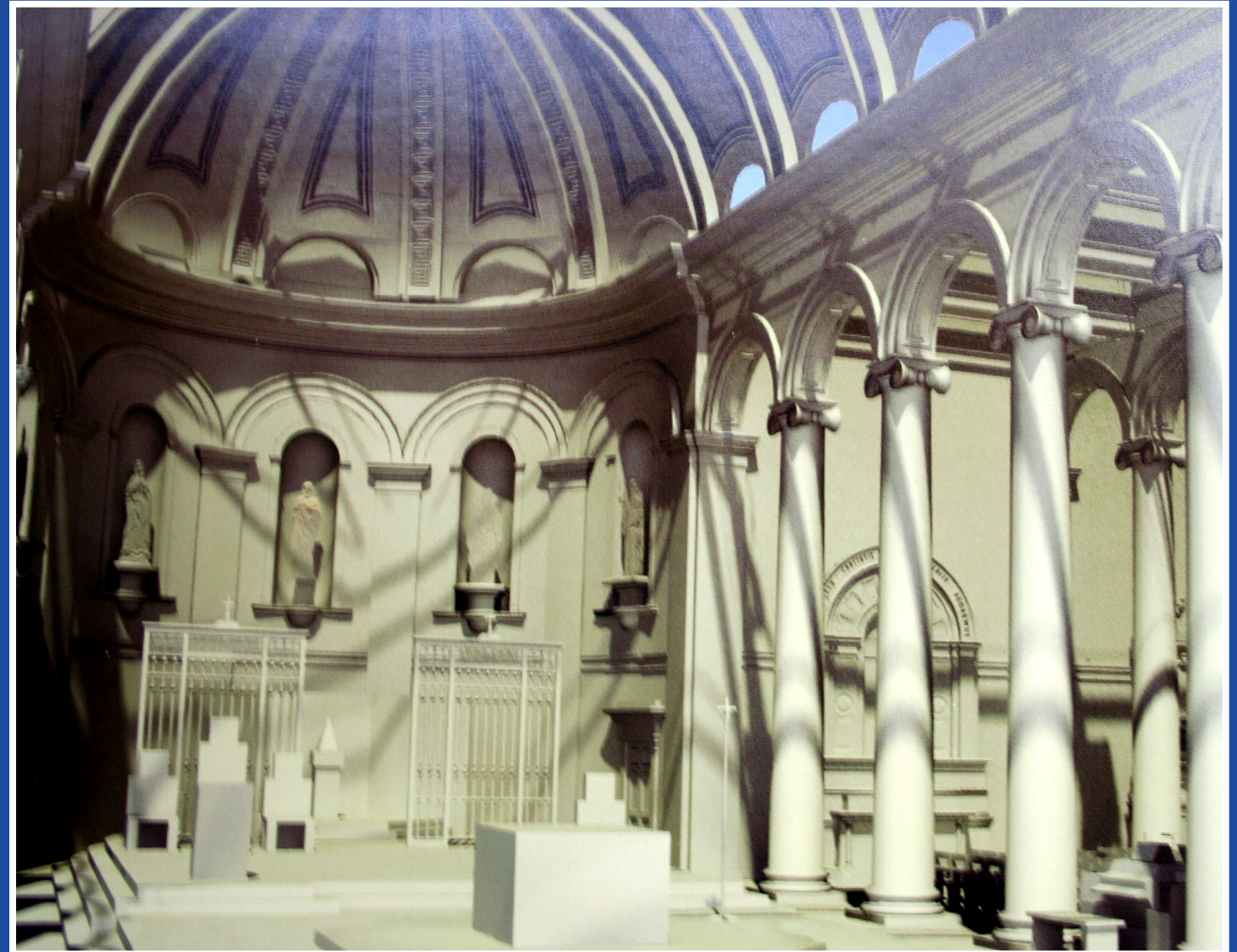
An early image of how Sanctuary Area might look after restoration.